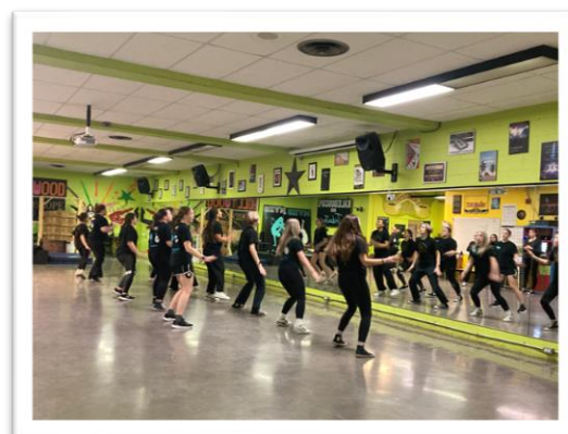
Massey-Vanier - November 20 th 2023

All three of our high schools were pleased to host in-person open house events this year! They were festive, informative and highlighted the very best the schools had to offer. We thank the organizing teams at Alexander Galt, Richmond Regional and Massey-Vanier High School for their collaborative efforts and spirit, as it is truly a team effort to showcase the programs, facilities and activities available for students. A warm shout out goes to the student leaders as well who gave personalized tours of the buildings pointing out all the little details important