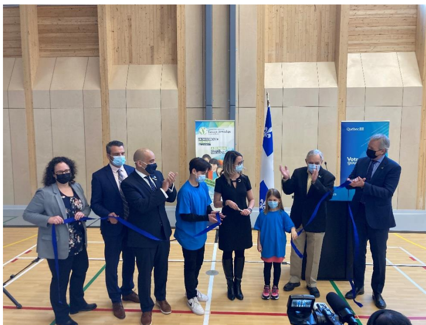
DRUMMONDVILLE ELEMENTARY SCHOOL'S Grand Opening!

This month the Council of Commissioners and Senior Administrators of the Eastern Townships School Board would like to signal the following: