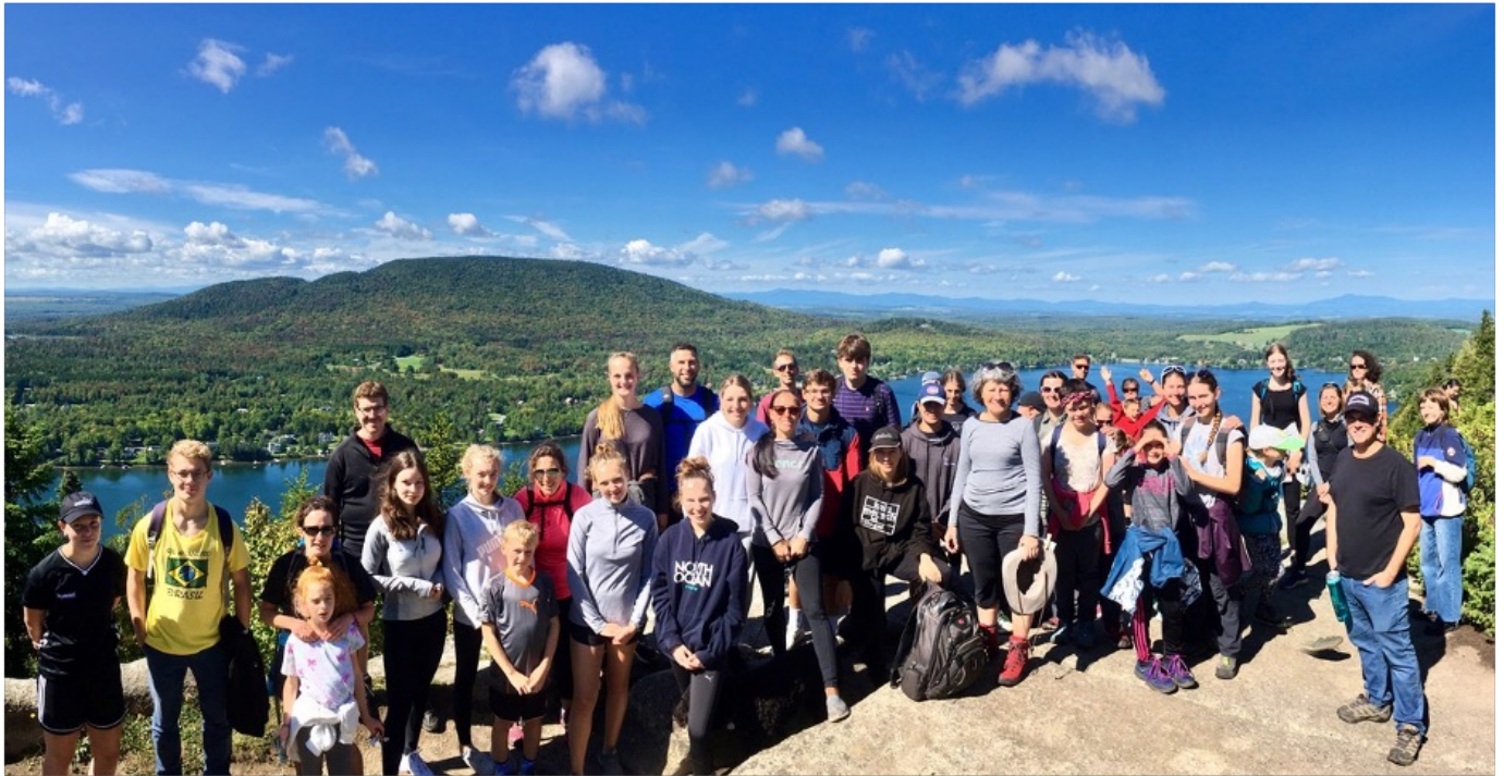
ISP welcoming activity, September 2021 at the Pinnacle.

Did you know the ETSB welcomes international students from all around the world? Over the past 12 years, we have welcomed over 500 students in our elementary and high schools and vocational centres. Students stay with us from a few weeks to a complete school year. Some will even stay in the province to continue their post-graduation studies.