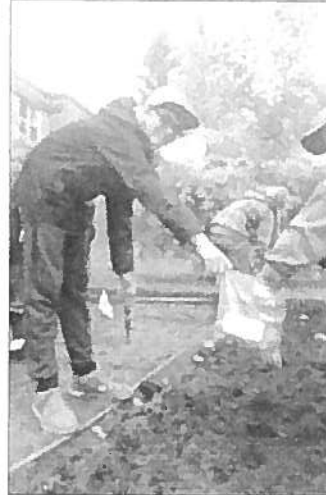
Students of all ages enjoyed their garden experience.