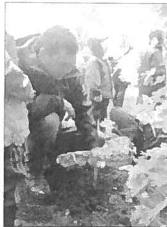
Visitors and students alike planted