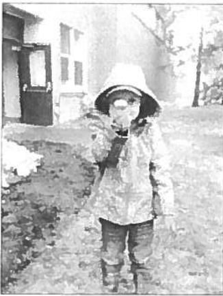
Do tulips have a smell when they come up

Come spring, everyone is invited to see the red and white tulips in all their glory on both school sites. Let the sesquicentennial party begin!