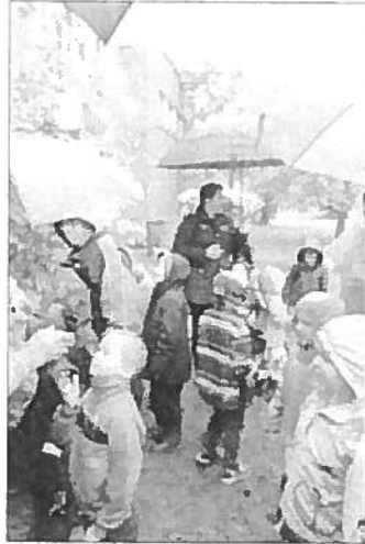
Despite the rain, the tulip planting was all done at Butler.