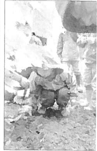
It's hard to believe that a flower comes of each bulb.