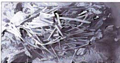
Barbara Ruttle Greenwood, parent "The garden program is amazing! Not only has it taught the kids the joy of growing their own food but by being a volunteer it has taught me alot as well and I enjoy seeing the smiles and curiosity of the children. Plus it gives extra snacks during the day that helps boost their energy. My daughter loved it so much she took care of her own garden at home and we had fresh food all summer long."