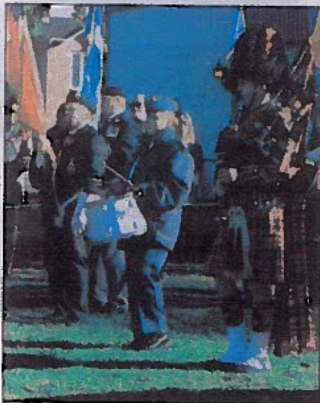
A piper and the Massey-Vanier Air Cadets form part of the Remembrance Day Parade in Cowansville.