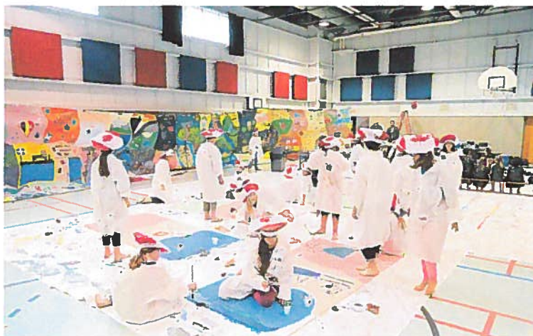
Une murale pour l'école et une autre qui prendra le chemin d'Ottawa ont été réalisées par les élèves de Sutton, mardi.

Tous les provinces et territoires seront représentés sur le projet baptisé Murale nationale des