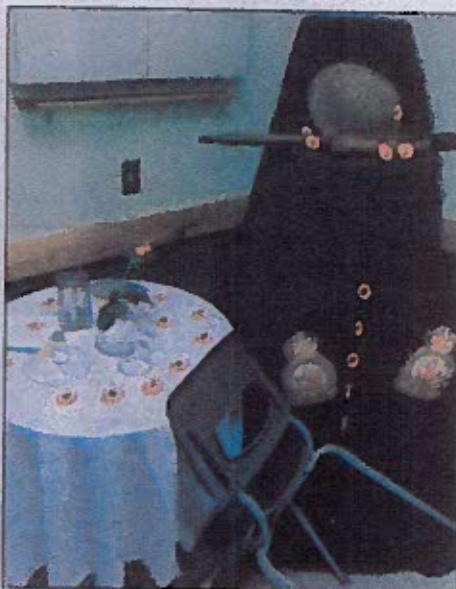
A special table is always laid out inside the legion to honour those men and women who do not return from service.