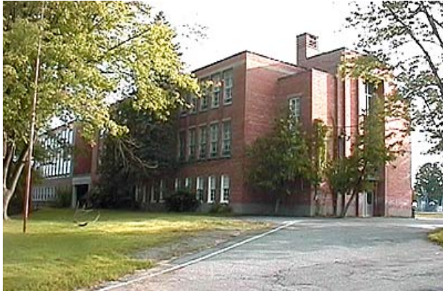
St. Francis Elementary School