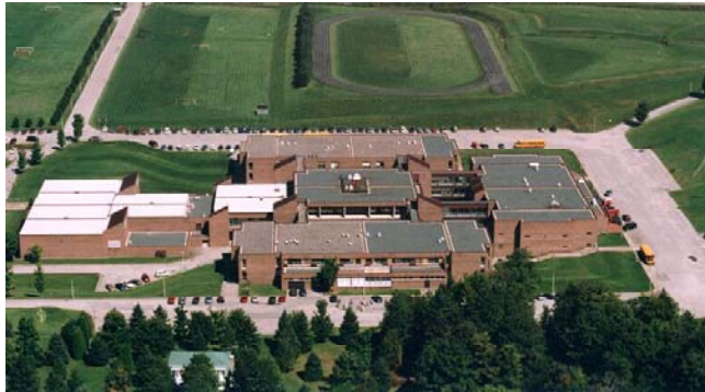
Eastern Townships Learning Centre